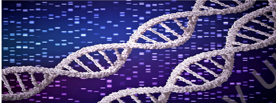
Genomics and metagenomics are coming in handy to analyse antimicrobial resistance. Representative illustration.